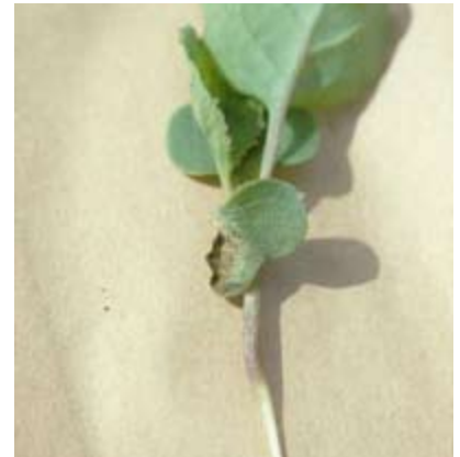
Figure 1. Canola seedling infected with blackleg.

Blackleg infections may occur on cotyledons, leaves, stems and pods. The plant is susceptible to blackleg infection from the seedling to pod-set stages. Lesions occurring on the leaves are dirty white and are round to irregularly shaped (Figure 1).