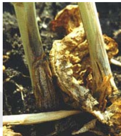
Figure 2. Blackleg stem lesion on adult plant.

On stems, blackleg lesions can be quite variable, but are usually found at the base of the stem, or at points of leaf attachment. Stem lesions may be up to several inches in length, and are usually white or grey with a dark border (Figure 2). Stem lesions may also appear as a general blackening at the base. Severe infection usually results in a dry rot or canker at the base of the stem. The stem becomes girdled and, as plants ripen prematurely, the crop is more likely to lodge. Seed may be shrivelled and pods shatter easily at harvest, resulting in seed loss.