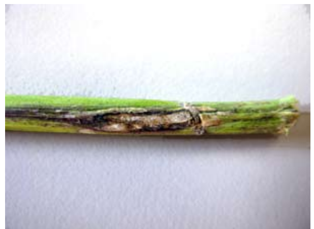
Figure 4. Hail damaged canola infected with blackleg.

Infection before the six-leaf stage is usually associated with serious yield loss. Stem lesions girdle the stem base, preventing the flow of water up the stem and often result in lodging of the crop. Infections initiated beyond the six-leaf stage cause less damage. Pod infection can result in infected seed, which serves as another source of inoculum for future infestation.