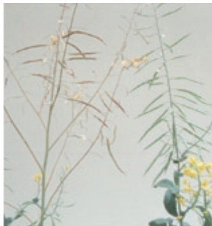
Figure 19. N-sufficient Raceme (left) and Deficient Raceme