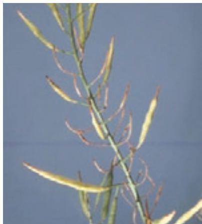
Figure 54. Boron-deficient Podding (left) Compared to Boron-sufficient Podding Canola