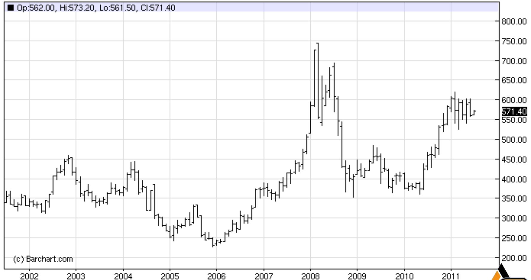
RS - Canola (WCE) - Monthly Nearest OHLC Chart